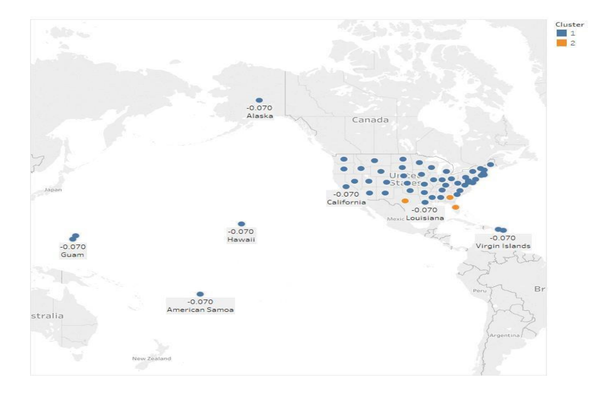
Figure 3. Subject Loss Clusters by States-based on Crime Types