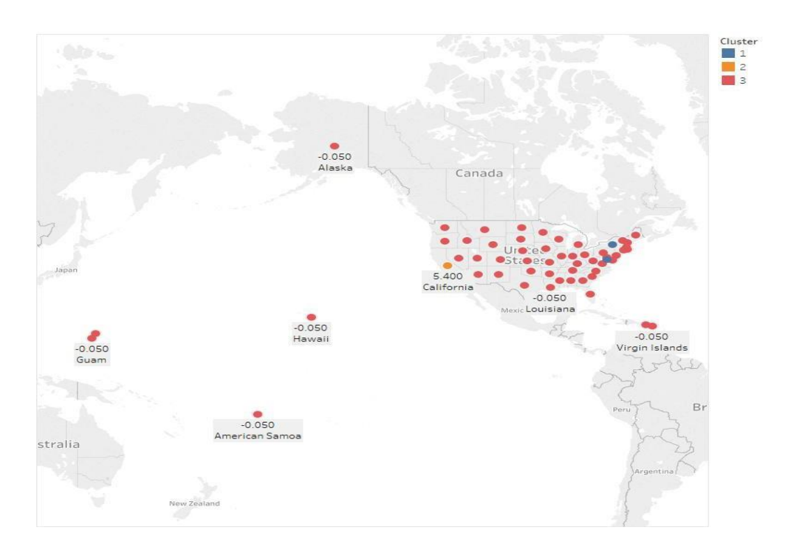
Figure 4. Subject Count Clusters by States-based on Crime Types