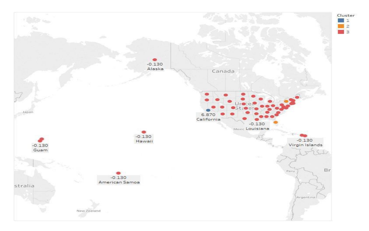
Figure 1. Victim Loss Clusters by States-based Crime Types

Cluster 2, consisting of Florida and New York, has an average victim loss that is much higher than clusters 1 and 3 with respect to the crimes in non-victim-perpetrator familiarity. Cluster 3, represented by over 50 states, has below average victim loss for all crime types. In order words, from the cluster analysis regarding victim loss resulting from cybercrime, California must pay attention to victim-perpetrator familiarity crimes, Florida and New York must pay more attention to non-victim-perpetrator familiarity crimes.